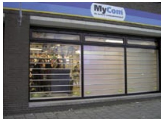
MyCom shop ADDscreen rollers in daylight.

In this new shutter system, the shop owner is able to connect the projection equipment to a PC and advertise by projecting text, images, or video on the ADDscreen. Euroll ADDscreen shutters with SABIC Innovative Plastics' Lexan SB305-OB sheet are generally specified for retail shop windows, exhibition areas and arcades. In such locations the shutters provide the dual benefits of out of hours security plus 24-hour customer access to the shop window advertisement. Also, these shutters can be used in town centers, where the addition of illuminated advertising makes streets brighter and, in turn, safer after dark.