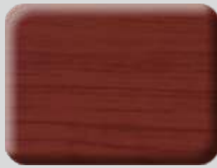
Colonial Red (HQPE) Stock