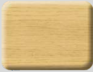
Elegant Oak EX. (HQPE) Stock