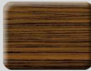
Light Wenge EX. (HQPE) Stock