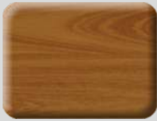
English Cherry EX. (HQPE) Stock