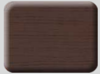
Wenge Royal (HQPE) Stock