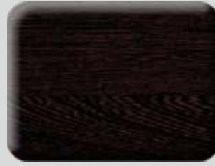
Dark Wenge EX. (HQPE) Stock