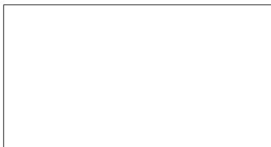
IJ3730-60 Inkjet printable film