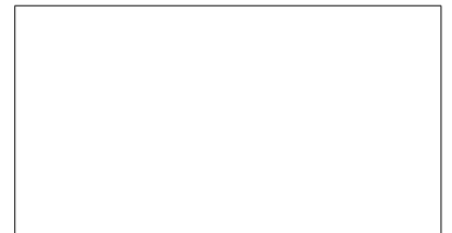
IJ3730-50 Inkjet printable film